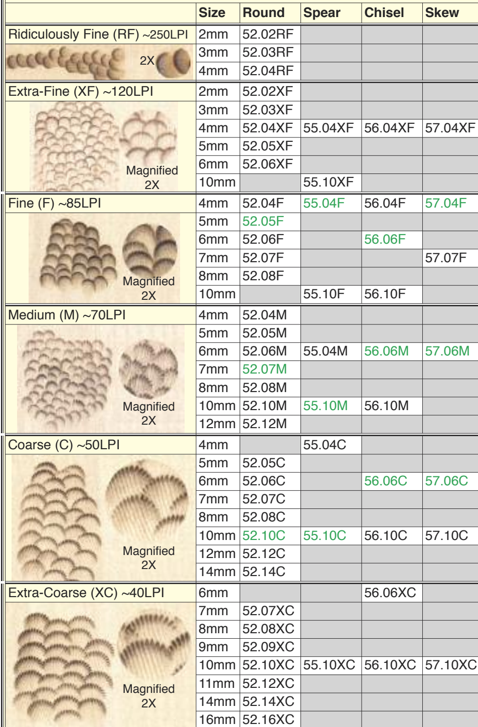
Table 2 - Availability by Size

Tips shown in GREEN are the tips included in sets.